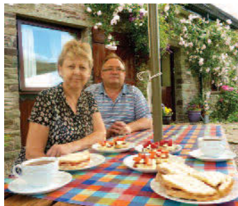
Old Radnor Barn Tea Garden.

By bike: National Route 8 passes through Talgarth.