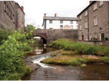
Above, top: Market Hall, bottom: River Enig. Right, top: The Tower, bottom: Pwll y Wrach.